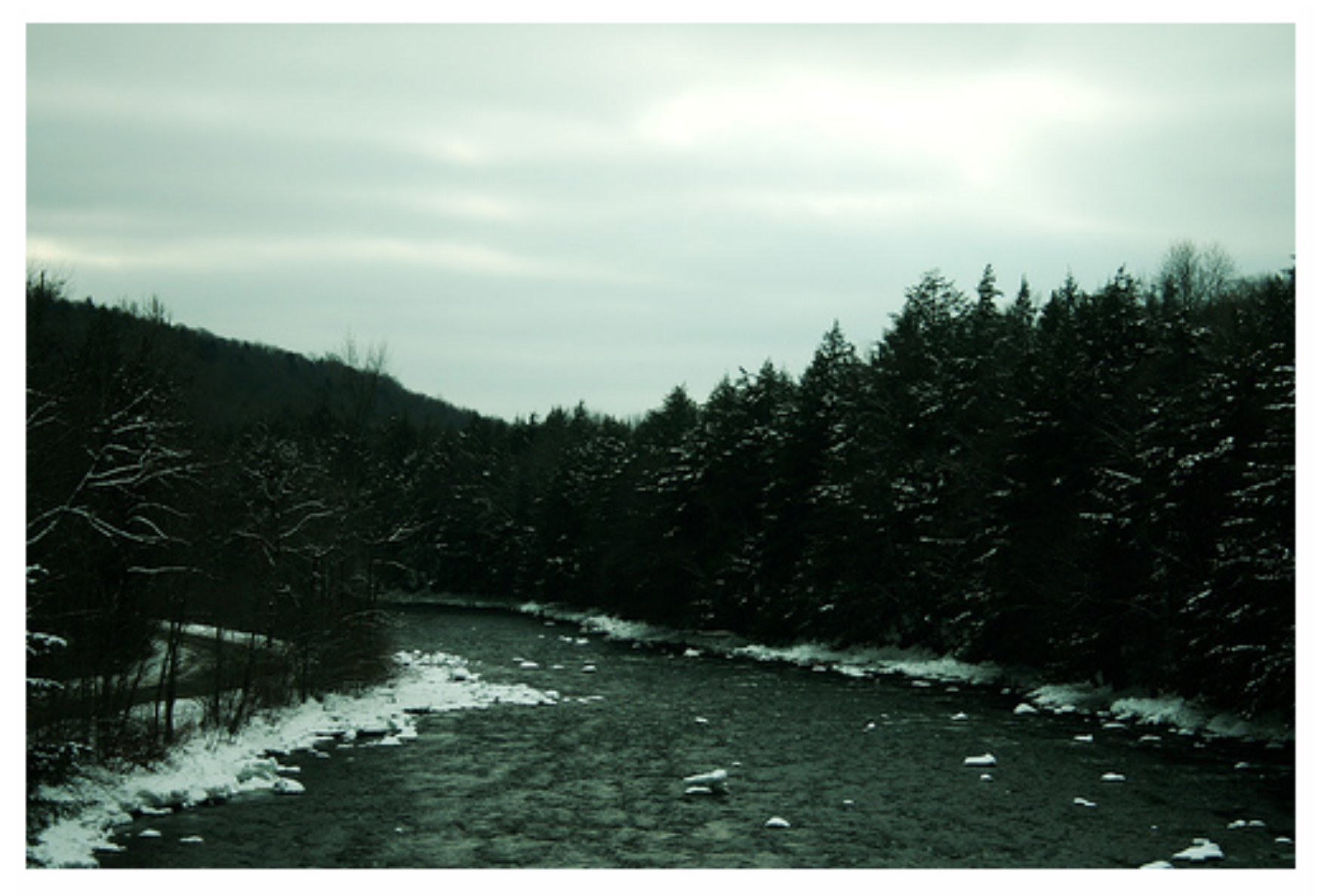
Taken from the car window, crossing the Hudson river in the Adirondack mountains.