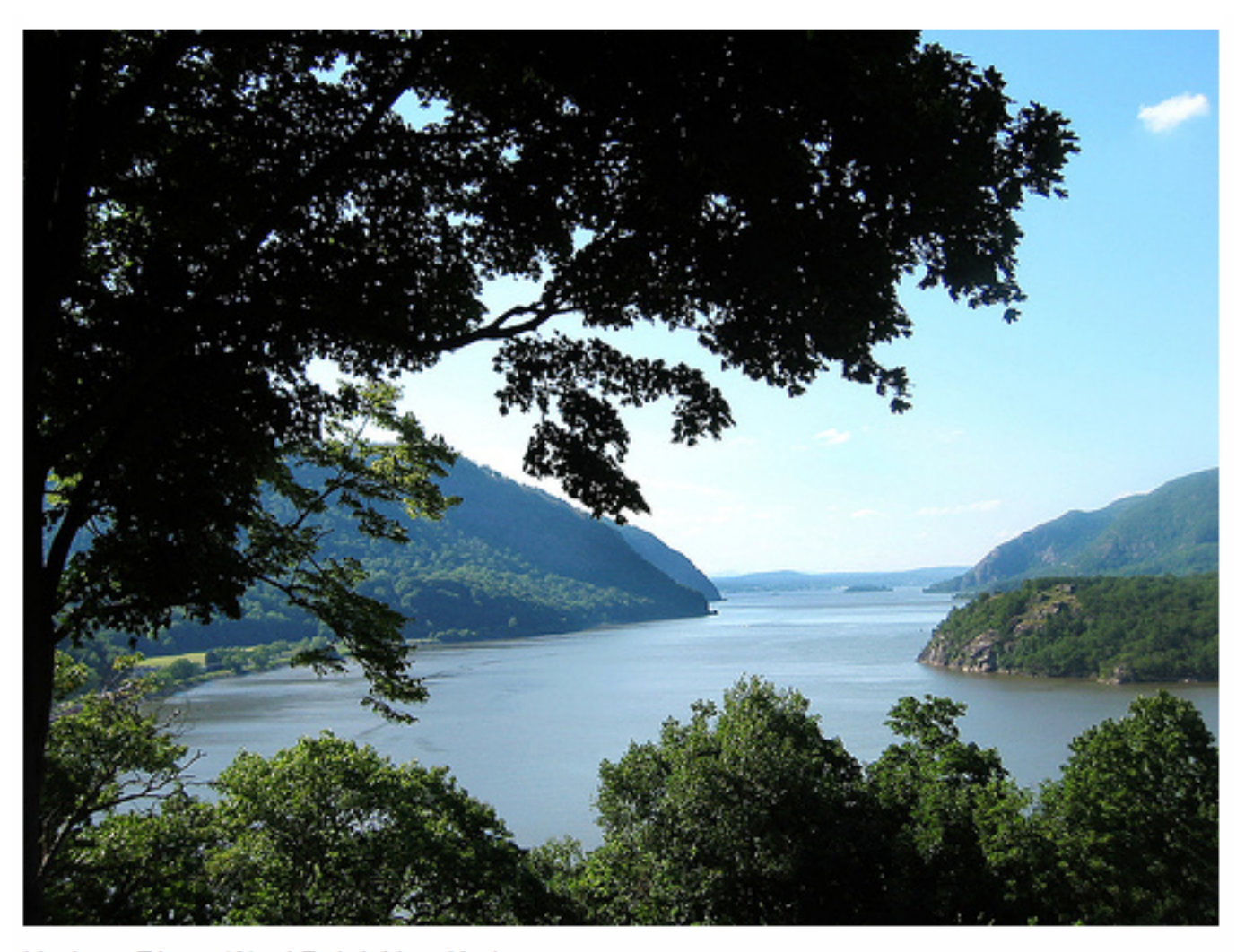
Hudson River - West Point, New York