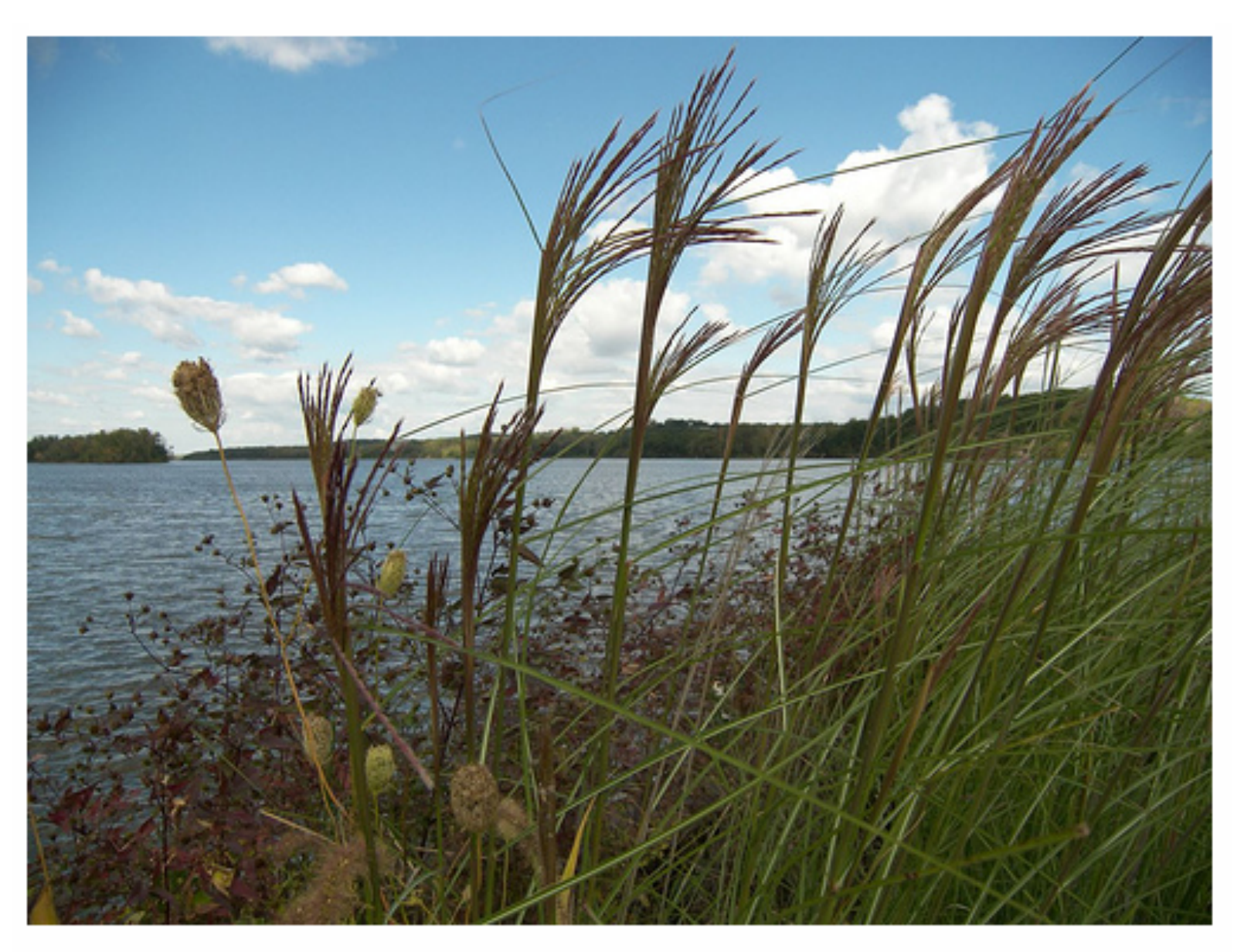
The Hudson river in Coxsackie, NY