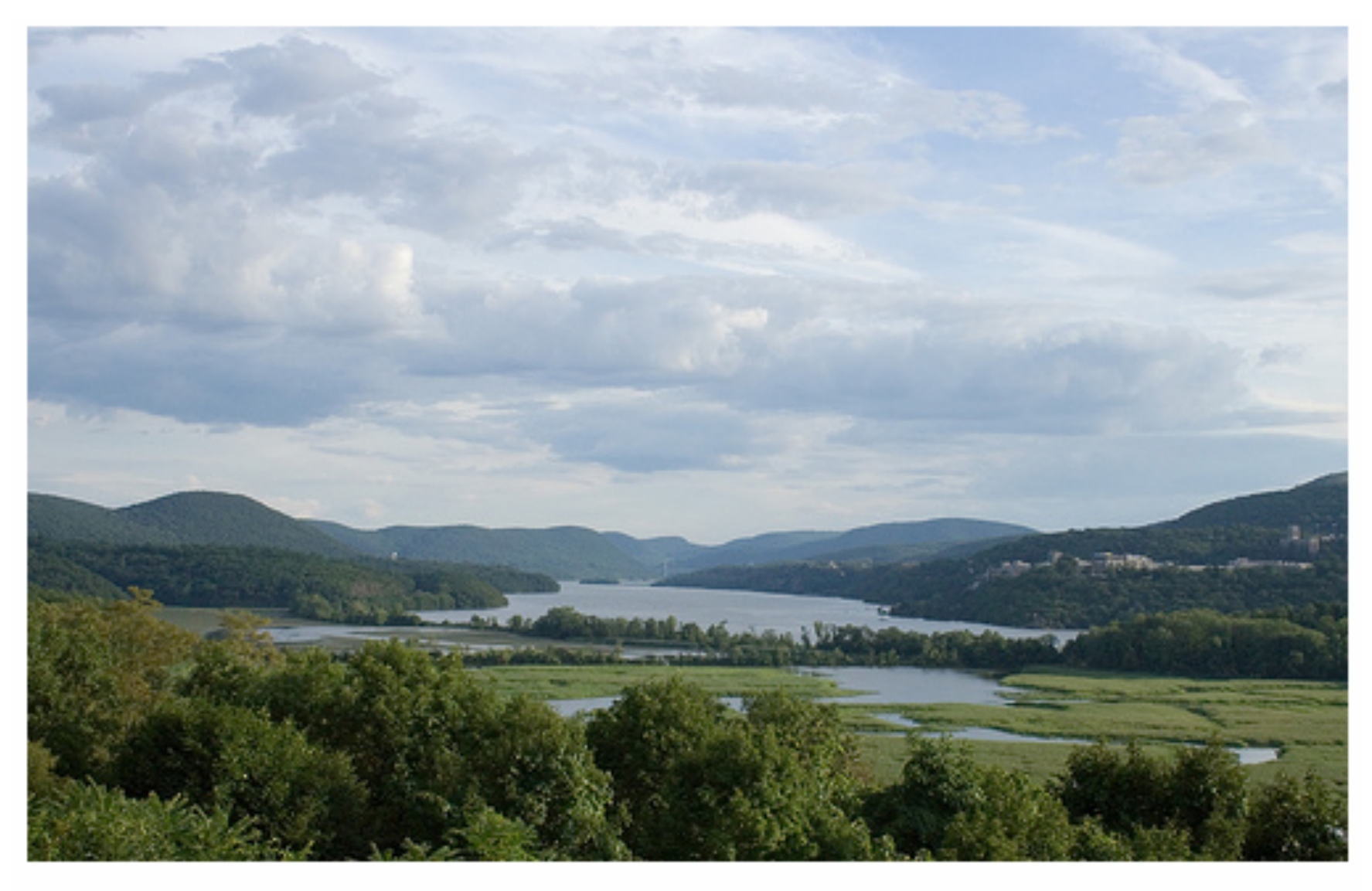
A view of the Hudson River from Boscobel Restoration in Garrison, NY.