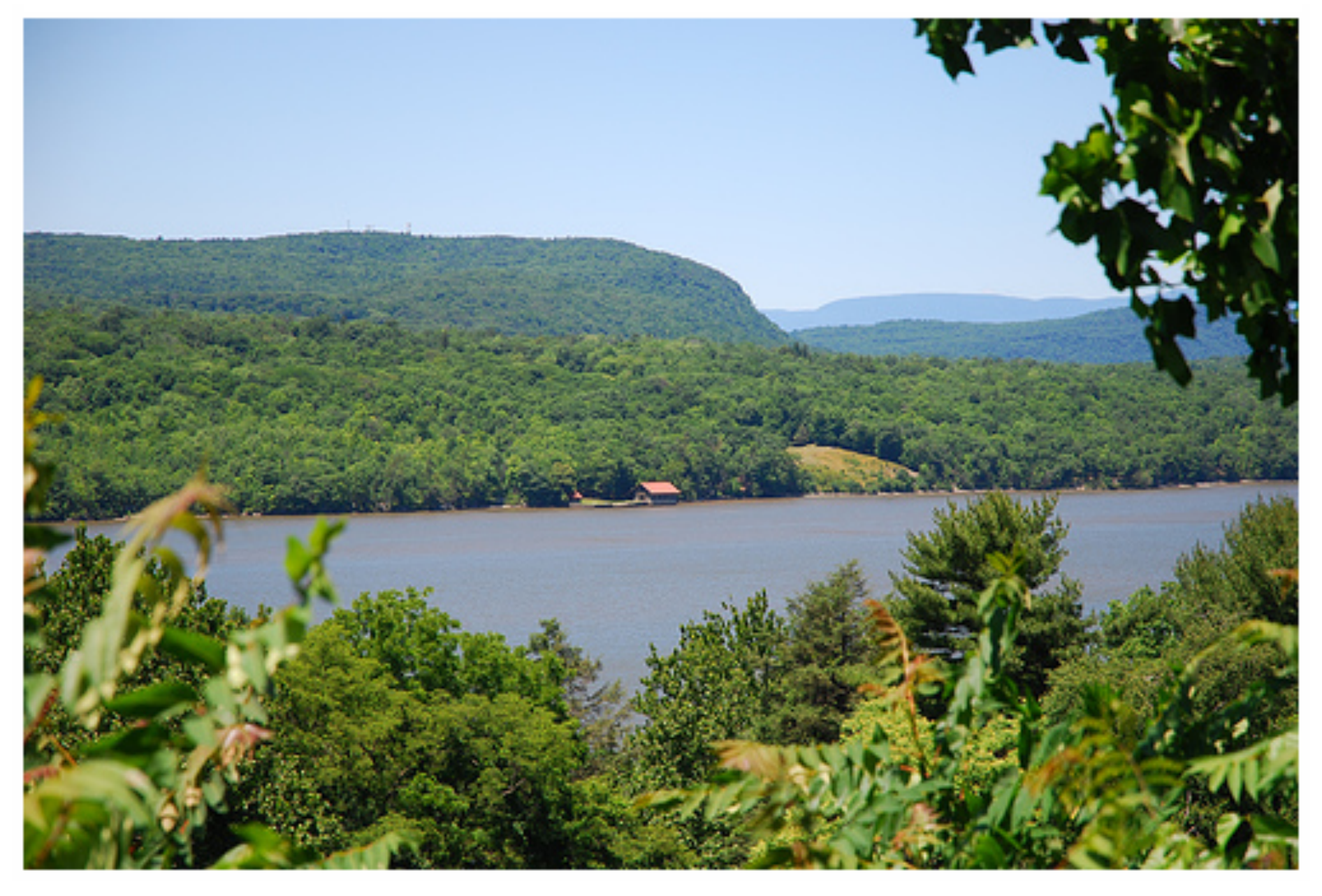
Another view to help you imagine what Hudson saw in 1609