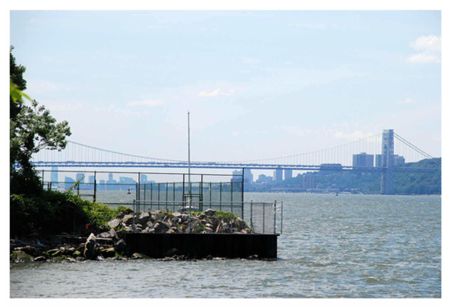
View of George Washington Bridge. Picture was taken at edge of wall off the Hudson River in Riverdale, New York. Photo was taken on Saturday July 21, 2007.